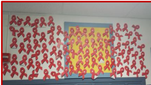
FYI students organize Red Ribbon Week activities each year