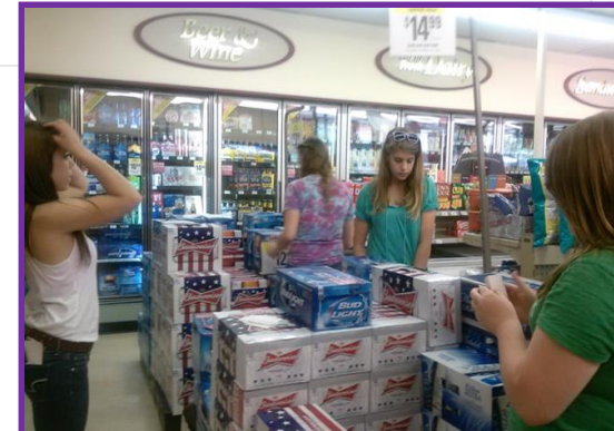
Sticker shock campaign at a local convenience store, 2014