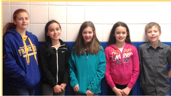
2015 Group Photo

FYI was expanded, forming a group in Franklin Middle School in the fall of 2014. The emphasis of their projects and activities are aimed toward helping with overall community health by focusing on youth substance abuse prevention and making healthy choices.