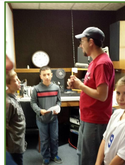
FYI students created & recorded a radio PSA to promote a local healthy and safe family activity: Odell Park In the Dark