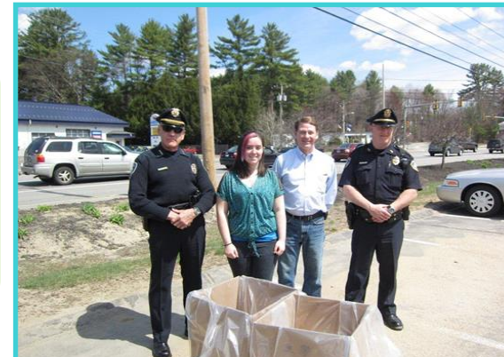
FYI joins local law enforcement on Prescription Drug Take Back Day, 2012