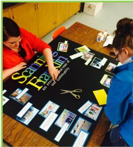
Group completing their Environmental Scan, taking photographs to document risk and protective factors in the community, primarily surrounding the topic of youth tobacco use. 2015