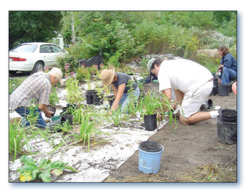
Figure 1. Homeowners and volunteers planted over 1000 shrubs, trees and groundcovers to reduce polluted runoff.

Maine's water quality standards require that lakes have a stable or decreasing trophic state, subject only to natural fluctuations. In Maine, a lake's trophic state is based on measures of chlorophyll a, Secchi disk transparency (clarity), concentration of dissolved oxygen and total phosphorus concentration.