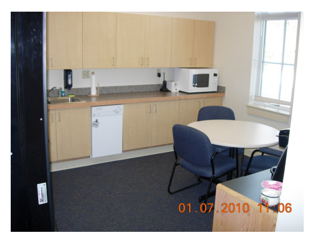
Break Room for Dispatchers