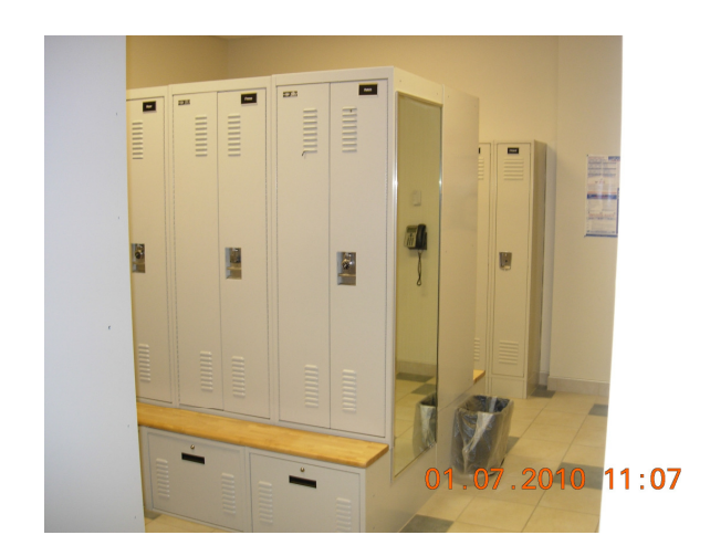
Men's Locker Room