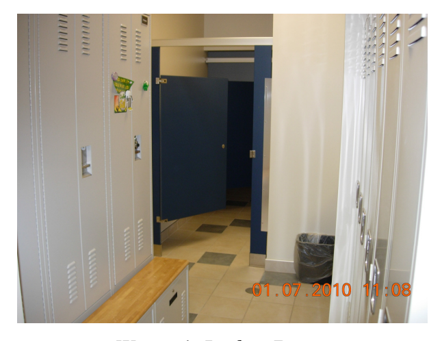
Women's Locker Room