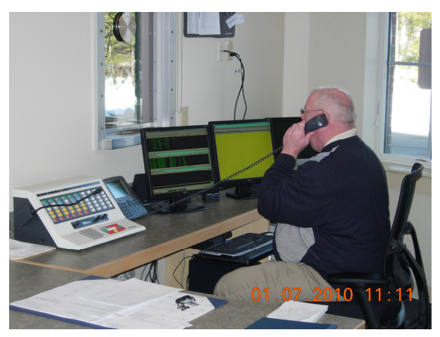
Back-up Communications Center