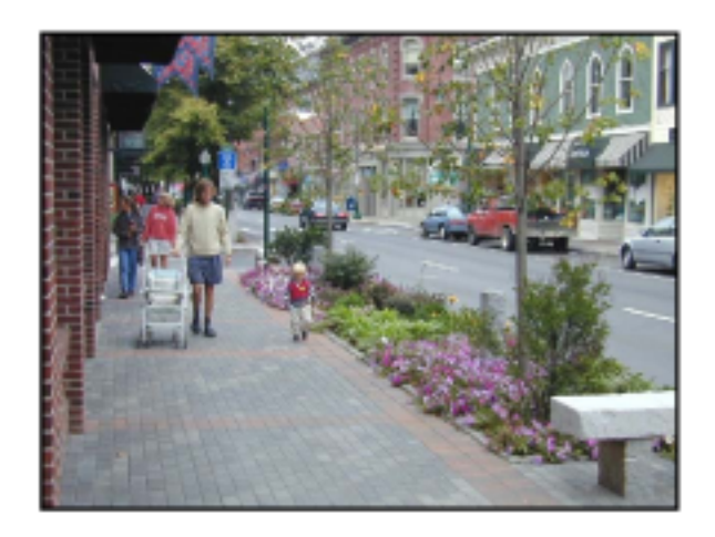
Or like this?

The State Planning Office can help ar swer questions you may have about th Growth Management Act and th comprehensive planning process i Maine. Please contact us at 207-28, 5649 or see our web site a www.maine.gov/spo.