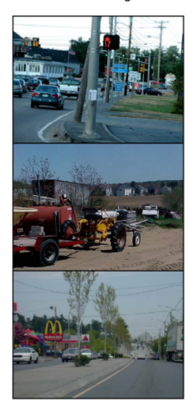
Does your town want to grow like this....