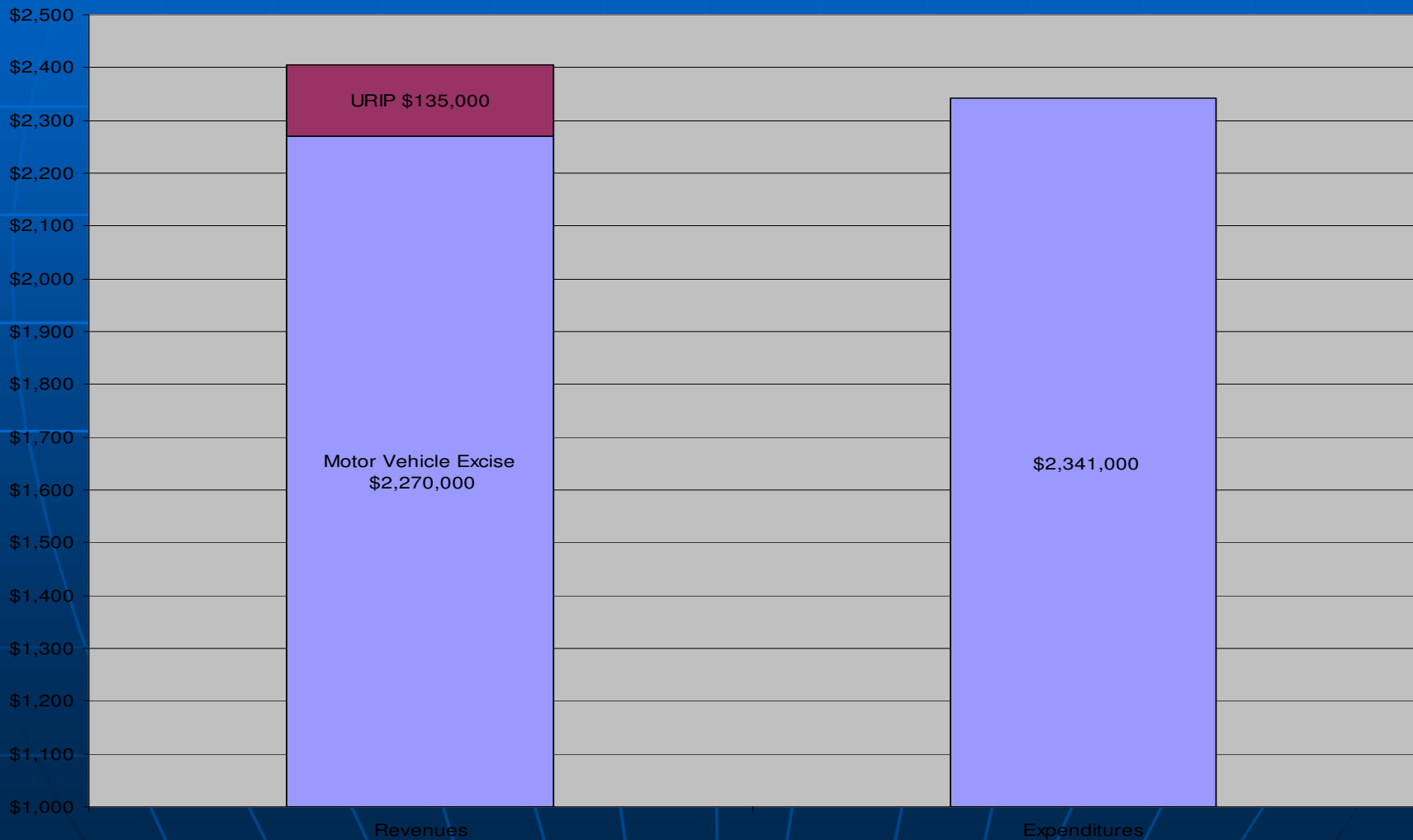
2010 Falmouth Road Revenues & Expenditures