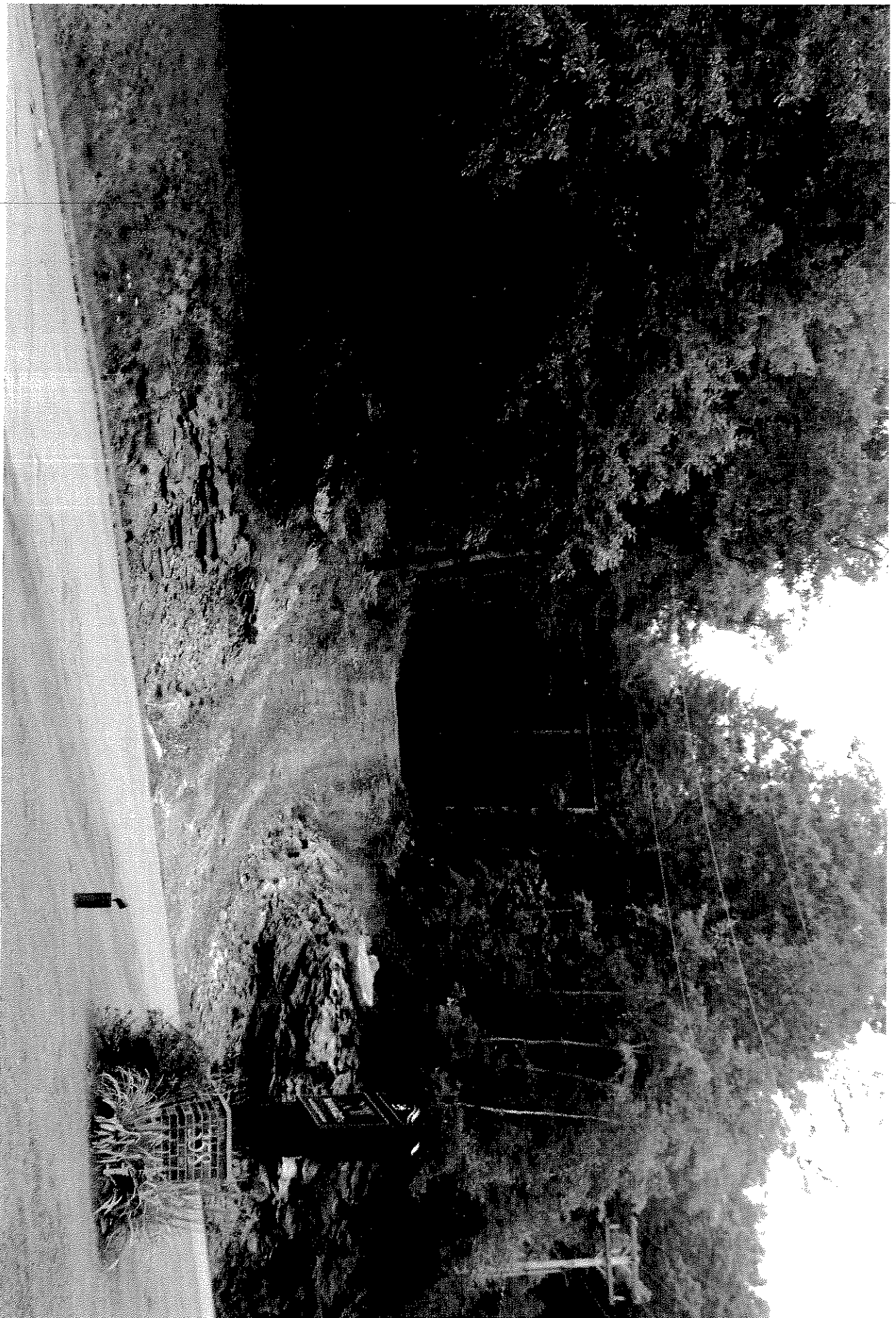
ACCESS ROAD LOOKING NORTH FROM ROUTE 1