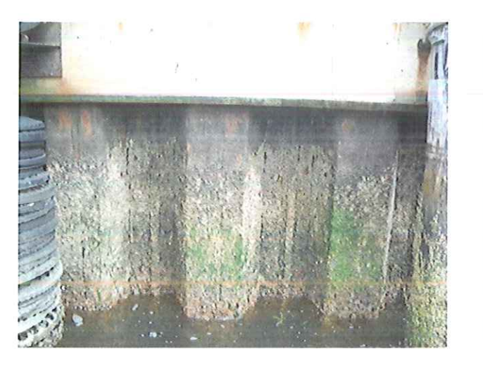
South Side - Steel Bulkhead