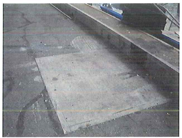
Concrete Patched Sink Hole