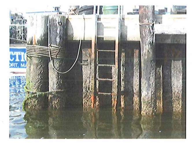
West Side - Steel Bulkhead at South Corner