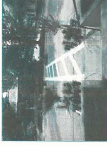
Pedestrian Crossing Demo: Swanzey, NH

Communities in New Hampshire have been nationally recognized by Smart Growth America as having some of the best complete street policies in the country. Each community has chosen a different path toward implementing the policies from City Policy to City Council Resolution. Some of these communities include: Portsmouth, Concord, Keene, Dover, and Swanzey