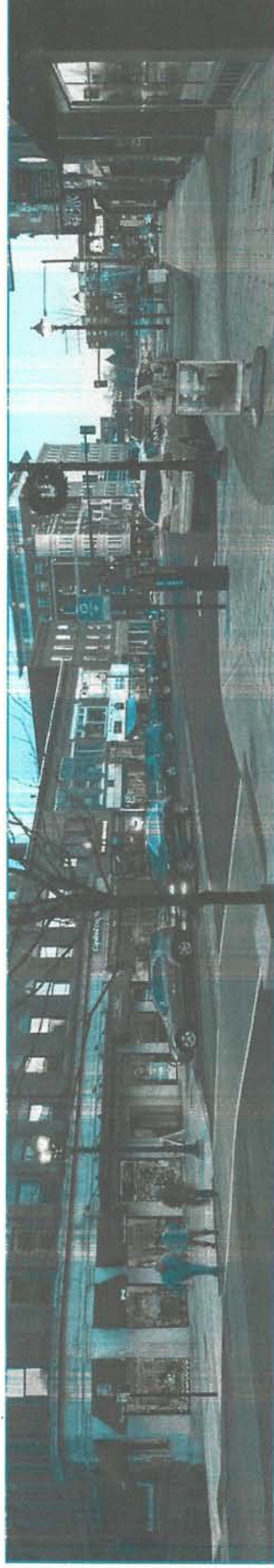
Main Street, Concord, NH