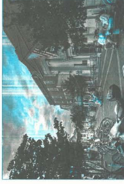
Market Street, Portsmouth, NH