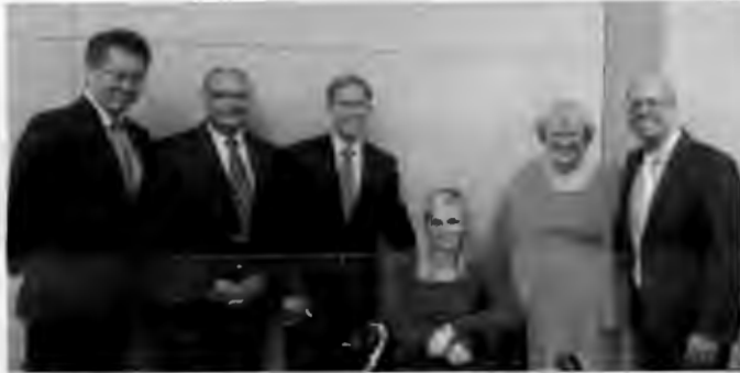
2015 Summit Speakers